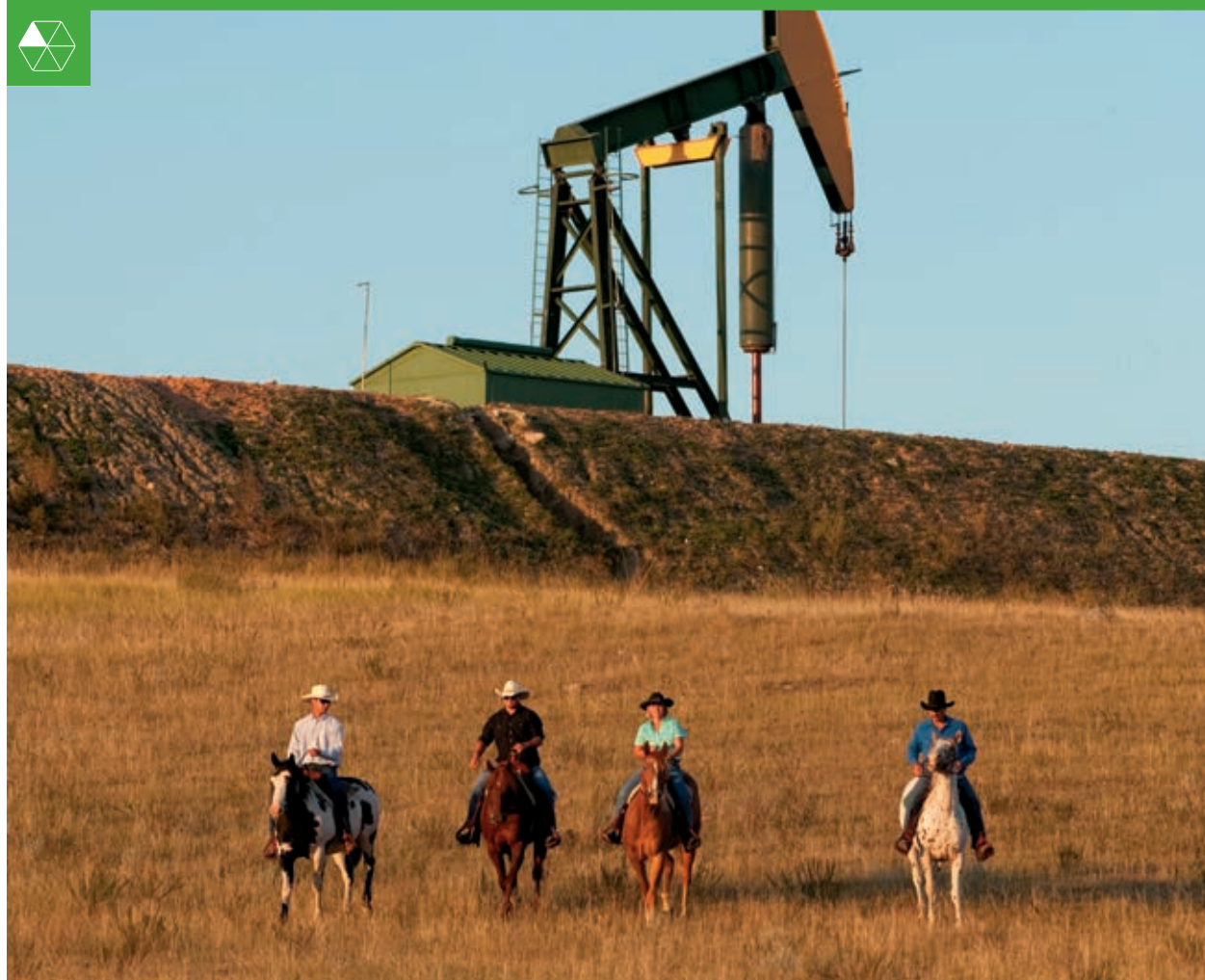
Onshore Production, United States