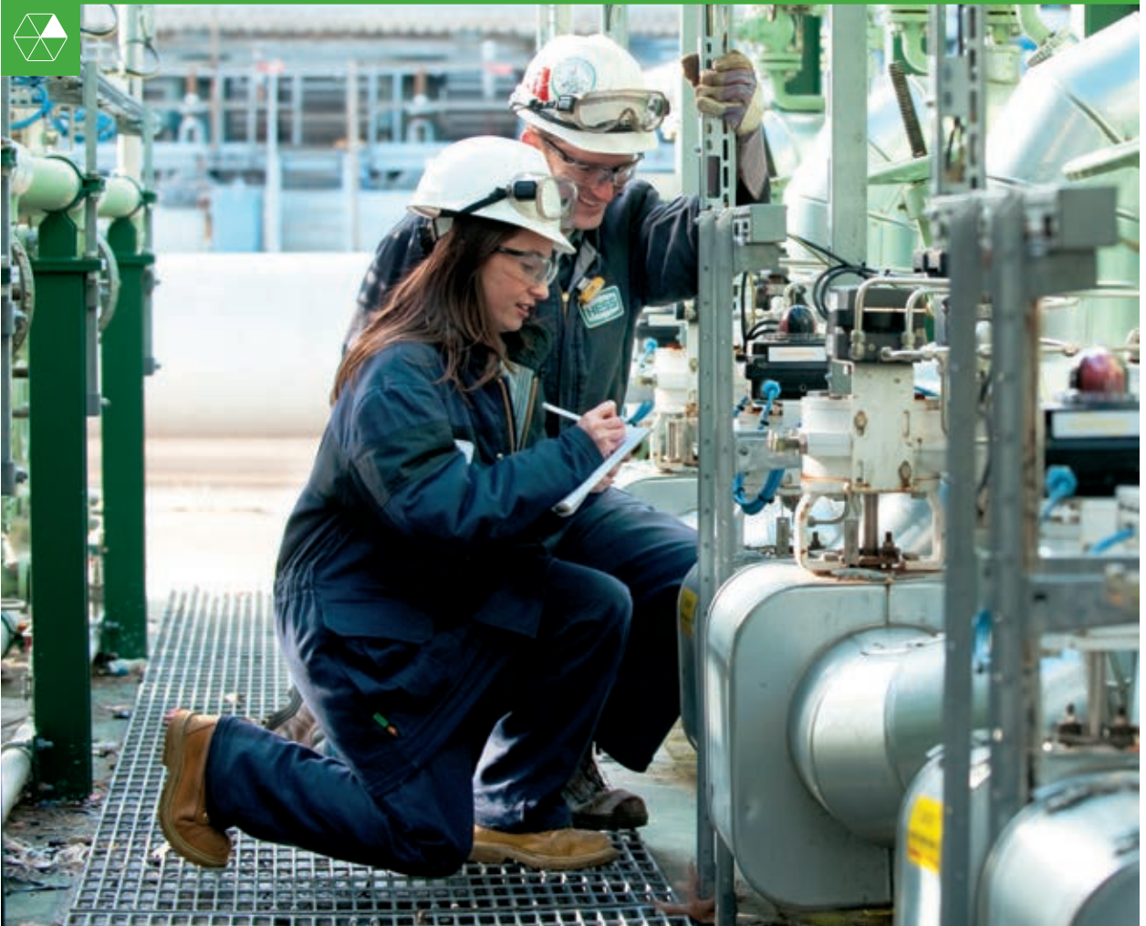
Refinery, United States