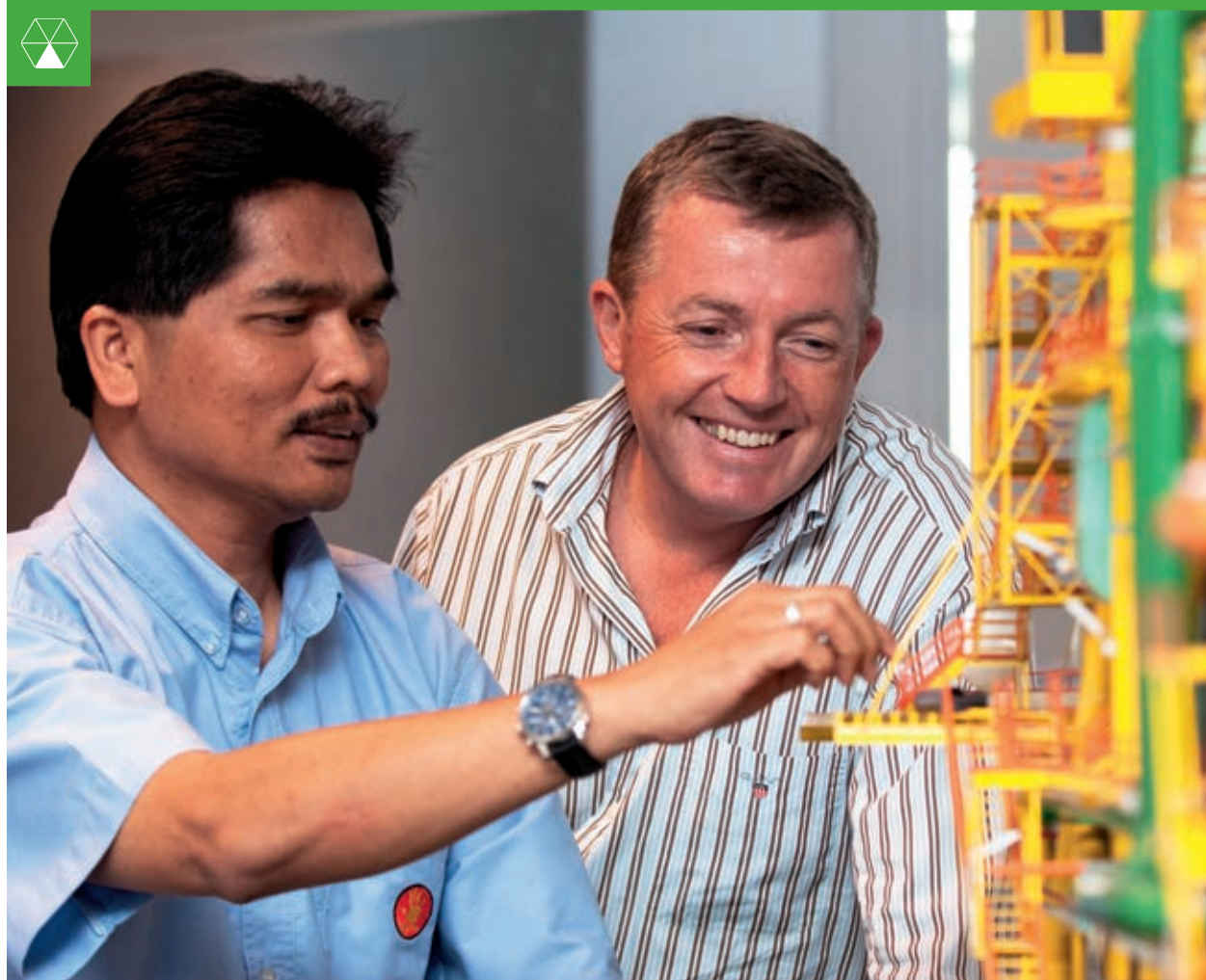
Production Platform, Southeast Asia