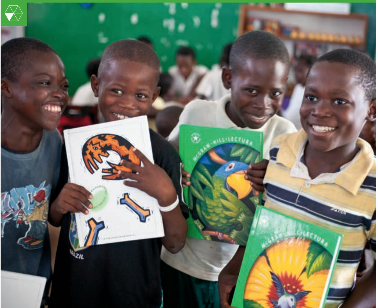
Education Initiative, West Africa