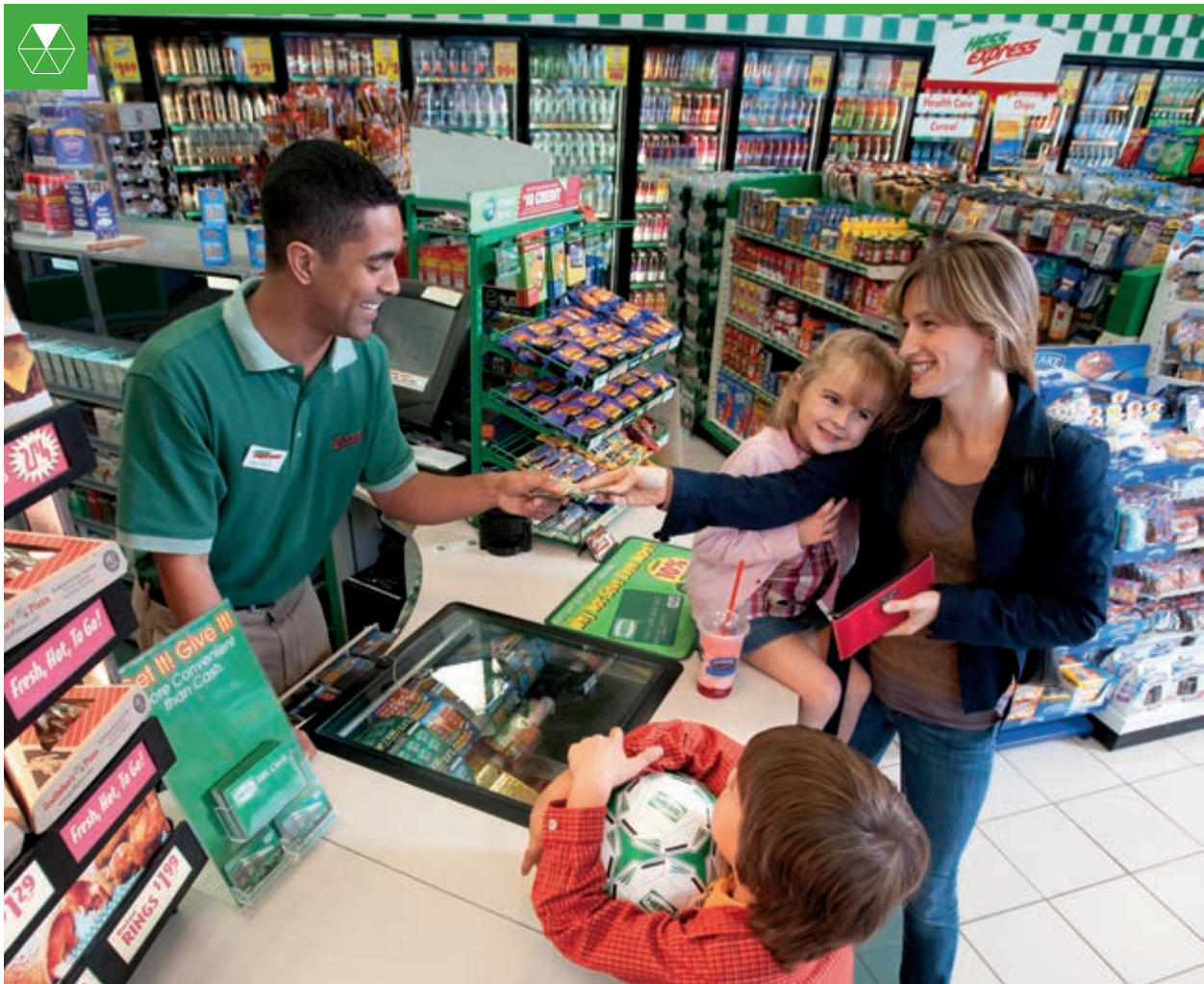
Retail Store, East Coast United States